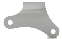
Left Medial Stirrup Model 3C76-MEDL