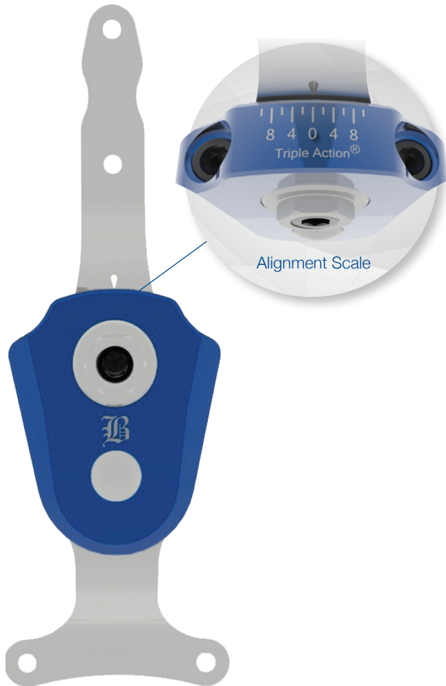
(Shown Full Scale)