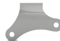
Right Medial Stirrup Model 3C76-MEDR